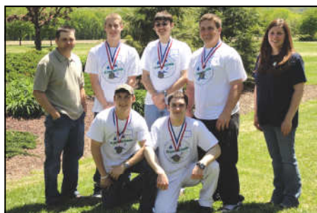
2nd Place: GNA Team A

At the State Competition, PennCrest High School from Delaware County placed 1st. MMI Preparatory ranked 5th out of the 67 schools competing and also achieved the overall highest score in the Aquatics division. Congratulations to MMI Preparatory Team A and all of our 2011 winners!