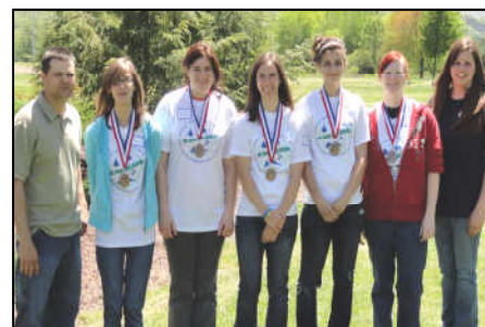
4th Place: GNA Team B