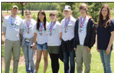
3rd Place: Crestwood Team A