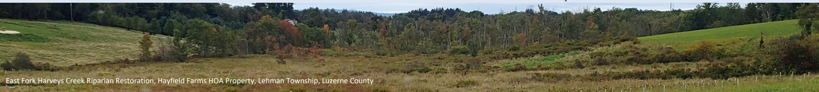
East Fork Harveys Creek Riparian Restoration, Hayfield Farms HOA Property, Lehman Township, Luzerne County